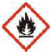
Flammable liquid and vapour