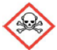
Fatal if swallowed