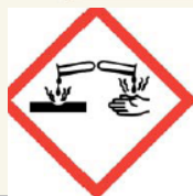
Toxic in contact with skin, causes burns

According to international standards, every chemical should have a label bearing the name of the product, a hazard statement, a signal word and a pictogram.